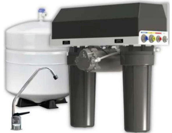
Warden LP, 4-Stage RO System →