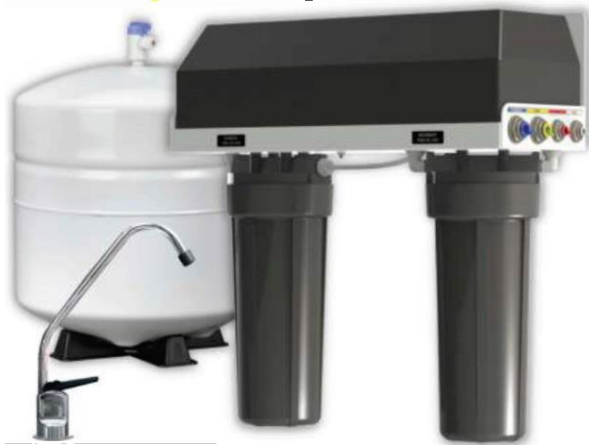
← Warden, 3-Stage RO System

Designed to provide crystal clear, fresh-tasting water, with the added convenience of FAST installation and EASY maintenance! Advanced encapsulated membrane technology offers industry-leading water recovery, meaning less water down the drain, and no hassle of handling raw membrane elements. Easy access side port connections provide a cleaner appearance and shorter installation time. Every system is engineered with high-quality components and an innovative design.