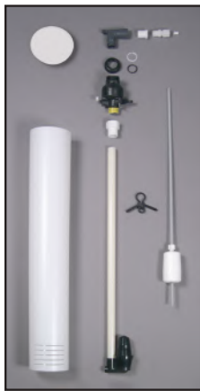
494 Brine Valve/5" Slotted Brine Well Component Kit