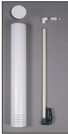
494 Air Check/5" Slotted Brine Well Component Kit