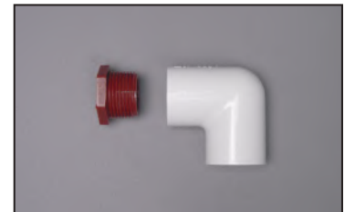
1" Commercial Overflow Fitting