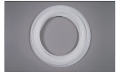
1/2 x 3/8 Natural Polytube 100 Ft Roll