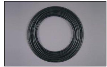
1/2 x 3/8 Black Polytube 100 Ft Roll